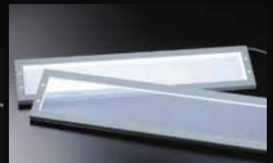
This series can also be used to form a thin, large-scale Light Box. Light Box shown in picture is B0 sized (1030mm X 1456mm).