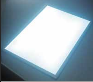
Luster Board (with frame) The panel's LED lighting is easy on graphics, making it ideal for advertising and guidance

electronics · mechanical products R&D and manufacturing